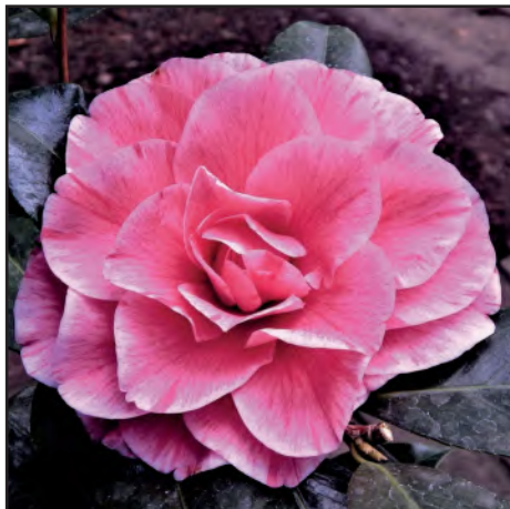
'CARTER'S SUNBURST BLUSH'

just as there is only one 'Elegans Champagne.' Some may prefer other brands of champagne or other japonica cultivars, but there can be no disagreement when 'Elegans Champagne' wins first place at a show.