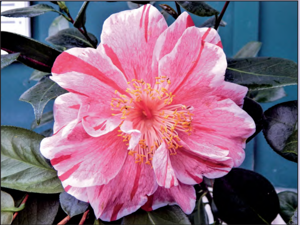
'STRAWBERRY FERRIS WHEEL'