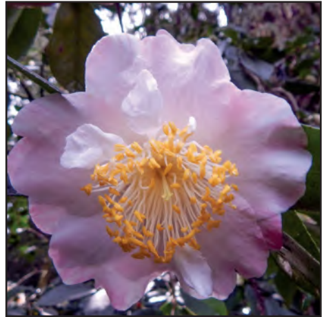
'PINK CORONATION SPORT'