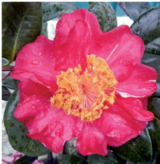
'RED FERRIS WHEEL'

The large to very large white C. japonica 'Ferris Wheel' has many random pink and red stripes which make the flower stand out on the plant or on the show table just as the Ferris Wheel does at a county fair. The flared stamens