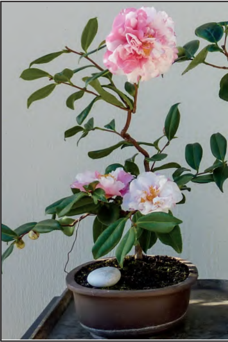
'SHIBORI EGAO CORKSCREW'